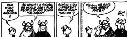
Fig. 1 1

Beowulf is, first and foremost, a royalist's poem, depicting a purely aristocratic world. 2 The concerns are those of one class of warriors; the focus of action is the king's mead hall: "we never see peasants engaged in growing their food or brewing their ale." 3 Beowulf enters the story as a prince and dies a king; indeed, there are over thirty different words for 'king' in the text. 4 Despite the persistent violence of Beowulf's world which appealed to early rediscoverers of the poem charmed by "wild and natural" Anglo-Saxon poetry 5 , there are elaborate hall rituals and a lengthy royal protocol for actions such as approaching Hrothgar's gífstol . The warriors seem to idle their lives away feasting, drinking, and quarreling; yet the evenings end with the company rising in unison (651).