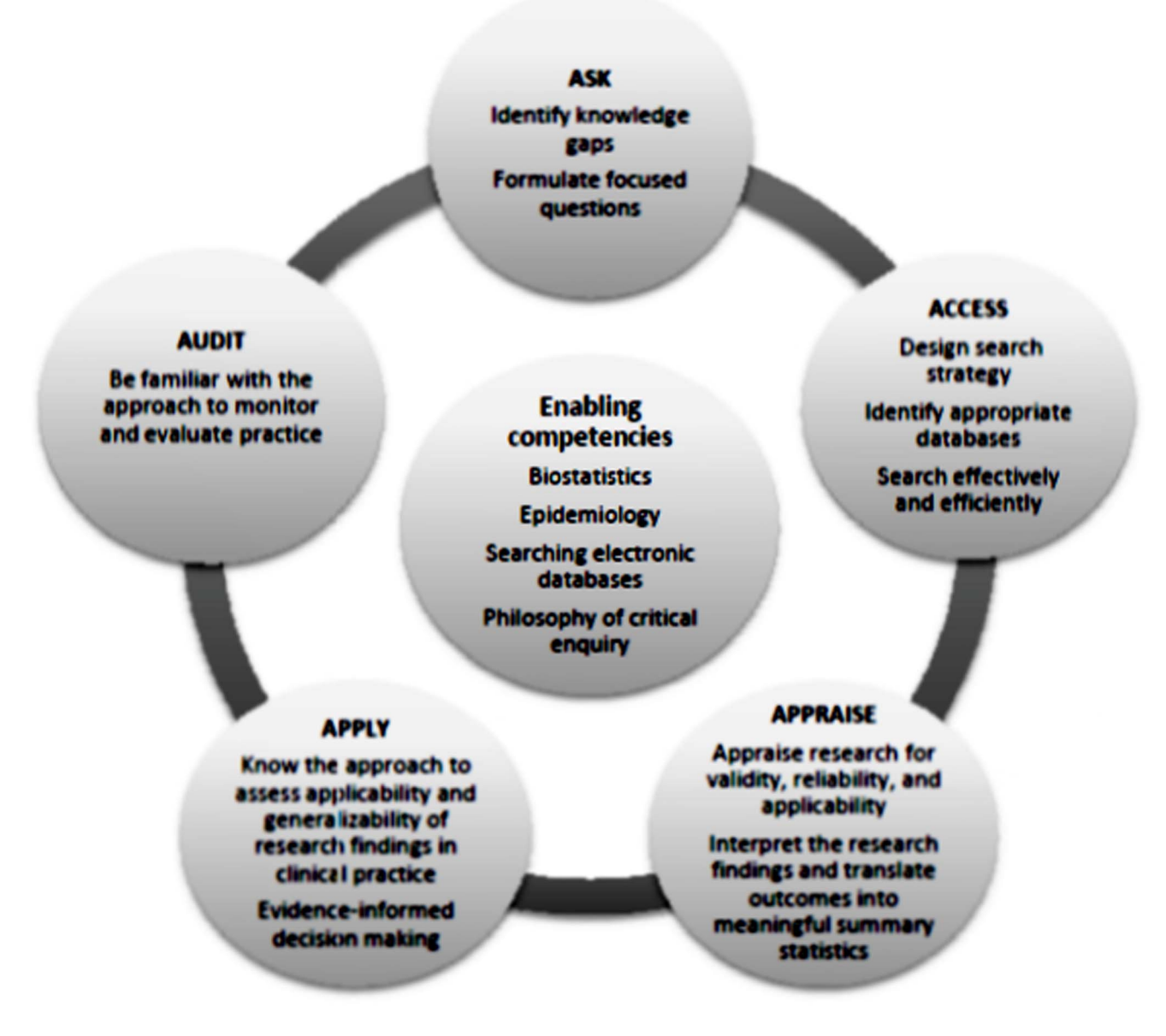
Figure 1. EBHC competencies. doi:10.1371/journal.pone.0086706.g001

of the records retrieved by the electronic searches were screened independently for relevance, based on the participant characteristics, interventions, and study design. Full text articles were obtained of all selected abstracts, as well as those where there was disagreement with respect to eligibility, to determine final selection. Differences in opinion were resolved by discussion.