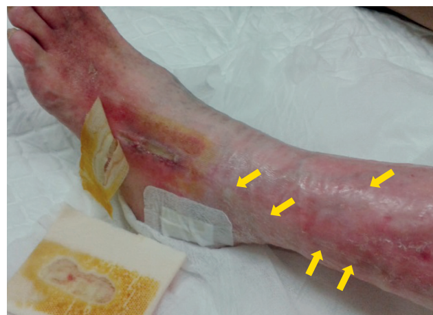
Figure 2 – Chronic ulcer with subcutaneous white calcifications (arrows)

A 76-year old woman was referred to the internal medicine department for subcutaneous calcifications on her legs (Fig. 1). She had a history of chronic venous insufficiency (CVI) of the lower extremities with chronic ulcerative lesions. The physical examination showed induration of the legs and subcutaneous white calcifications (Fig. 2). The patient had no other associated illnesses and had normal levels of parathyroid hormone, calcium, phosphorus, serum creatinine and 25-hydroxycholecalciferol. The immunological study for scleroderma, antiphospholipid