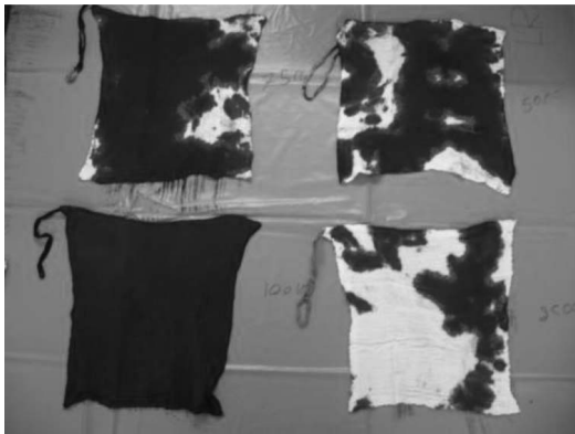
Fig. 1. Blood absorption characteristics of a dry 30´30 cm abdominal swab. For this particular type, 25 ml of blood saturates about 50% of the surface area, 50 ml of blood saturates about 75% of the surface area, 75 ml. of blood saturates the entire surface, and 100 ml of blood will saturate and drip from the sponge

* Proficient nurse was the nurse who had accurate estimation