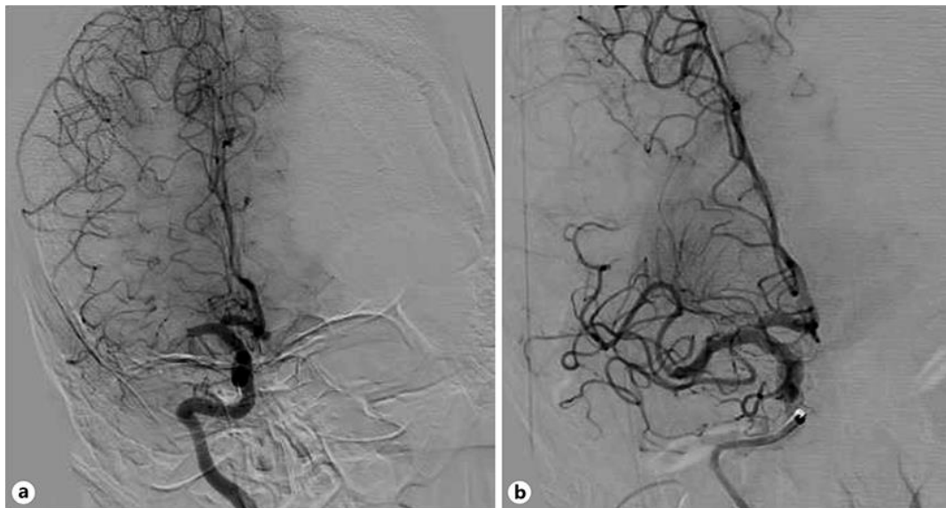
Fig. 2. a Digital subtraction angiography of the right internal carotid artery before thrombectomy showed occlusion of the right M1 (main) medial cerebral artery. b Successful thrombectomy with complete recanalization (TICI grade 3) of the right medial cerebral artery.