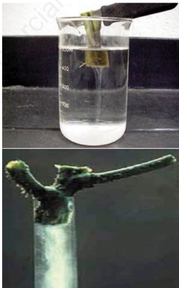
Figure 2. Bacterial ooze detection from infected stem of potato.