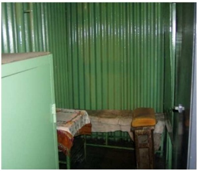
Figure 3 Inefficient use of a desktop

volume of production was not much considered, and basically, no space for their storage was specified. Pallets were often placed on completely inappropriate sites, such as routes between machines. With higher production volume, movement in the production areas was very difficult. In the new arrangement, there are places marked in colour, reserved for a variety of products, semi-finished products and waste. The creation of three separate projects also meant the division of workers. The division into smaller groups working on the particular project has resulted in the development of employees' team approach. Smaller groups of workers make it possible to establish and develop a philosophy of teamwork more easily.