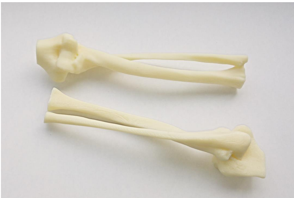
Fig. 4. Physical models of a congenital bilateral radio-ulnar synostosis made by 3D printing method

In presented case, at a stage of planning the procedure of surgically dividing bones in the congenital radio-ulnar synostosis, physical models of mentioned condition were used. These models were created on 3D printer using Fused Deposition Modelling technology (FSD) by extruding a thermoplastic filament, layer by layer, on a moving platform, lowered after each layer. After the process, any residues of structural filament, used as support for regular filament, are being removed, either mechanically or under pressure in a washer.