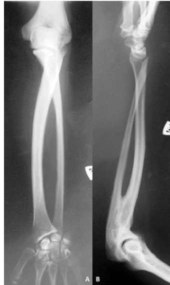
Fig. 1. X-ray image of the left forearm in postero-anterior (a) and lateral (b) projection

In order to assess the exact anatomical changes, a computed tomography (CT) with 3D reconstruction was advised for both forearms (including elbow joints).