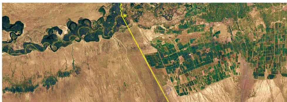
Fig. 4. Satellite image from 2014 of the area where the Ili River flows westward from China into Kazakhstan. The border is indicated, and the river crossing is marked with an asterisk. The river and riparian vegetation are clearly demarcated from the surrounding arid landscape in Kazakhstan. Irrigated fields extending to the border are visible on the Chinese side.

Water security for southeastern Kazakhstan is narrowly based in a geographical sense and heavily dependent on inflows from China. The future distribution of Ili River water is thus a matter of immense strategic importance for both countries and has been the subject of numerous negotiations spanning almost a quarter century [19, 20, 21]. Kazakhstan's position in these negotiations remains precarious, because China, a much larger and more powerful country, controls the upper reaches of the basin. Indeed, China rejected Kazakhstan's 2007 offer to exchange free or heavily discounted food for a commitment to allow the river to flow unimpeded into Lake Balkhash.