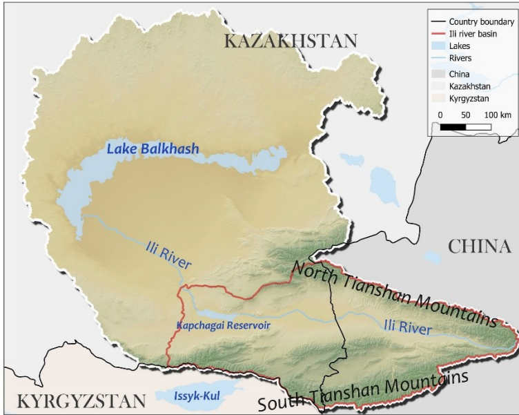
Fig. 1. Map of the Ili River basin, which encompasses all of the Chinese portion of the larger Ili-Balkhash basin, as well as southeastern portions of the Ili-Balkhash basin (including Kapchagai Reservoir) in Kazakhstan.

China (Figure 1), and flows through a rich delta before delivering 70-80% of the total inflow into terminal Lake Balkhash [8, 9]. The catchment area is about 140,000 km 2 , and although 55% of this area lies in Kazakhstan, it contributes only 20-30% of the inflows entering the Ili River [10]. The river is mountain-sourced and predominantly fed by glacier-snow melt that occurs at altitudes above 2,000 meters in the Tian Shan mountains. The basin of the Ili River is influenced by precipitation in the warm period, which is especially abundant (800-1,200 mm/year) in the high-altitude mountains [11].