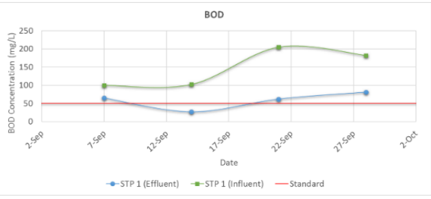
Fig. 1. Biochemical oxygen demand (BOD)

Data gathered for BOD for STP 1 is shown in Fig. 1. It ranges from 27 mg/L to 81 mg/L.