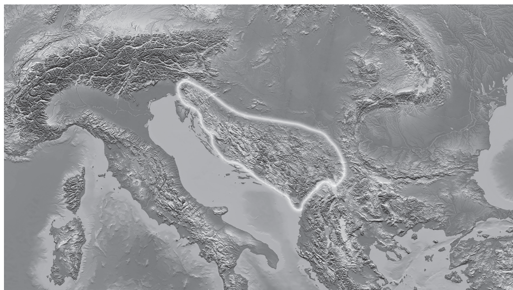
FIGURE 2 Borders of Dinaric Alps mountain range

height regarding the administrative regions of Kosovo, and confirm whether the tallest people live in the area of the Dinaric Alps (Pineau et al., 2005). In contrast, it would be expected that the population is on average somewhat shorter in the central part of Kosovo, outside the range of the Dinaric Alps. Furthermore, the capital city of Pristina is a place where people from all the regions meet after decades of migration due to better living conditions; therefore, it cannot be taken into consideration as a factor for any fundamental analyses, so it will only be analysed descriptively.