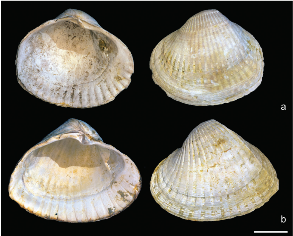
Figure 3. Didacna baeri versus D. eichwaldi from Holocene (Novocaspian) deposits of Turali Lagoon (Dagestan, Russia). a RGM.961899, Didacna baeri (Grimm, 1877) b RGM.961900, Didacna eichwaldi (Krynicky, 1837), same locality. Scale bar: 1 cm.

Taxonomic notes. In recent works (Kijashko in Bogutskaya et al. 2013), the species Didacna crassa (Eichwald, 1829) [= D. eichwaldi (Krynicky, 1837)] has been considered a synonym of D. baeri . However, we see morphological discontinuities in our extensive material from the northern Caspian Sea Basin that implies that D. eichwaldi with its protruding umbo and shouldered appearance is distinct from D. baeri that is characterised by a rounded umbo (see discussion above under D. baeri ). Despite being in common usage, the name Didacna crassa is invalid as it is a junior homonym of Cardium crassum Gmelin, 1791; Krynicky (1837) introduced Cardium eichwaldi as replacement name.