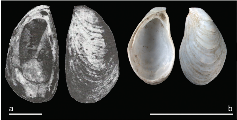
Figure 4. Lectotype Dreissena rostriformis versus D. grimmi . a D. rostriformis Deshayes, 1838. Lectotype. Pliocene, Crimea. Reproduced from Archambault-Guezou (1976, pl. 6, fig 2a-2c) b RGM.961901, D. grimmi (Andrusov, 1890). Caspian Sea offshore Aktau, Kazakhstan, sample KAZ17-21, depth 44.3 m. Scale bar: 1 cm.