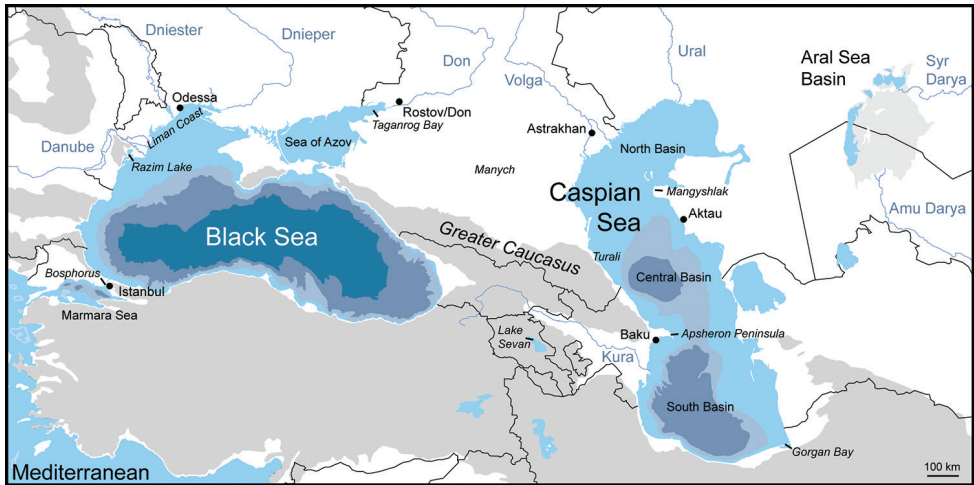
Figure 1. Map of the Pontocaspian region with the indication of major basins, rivers, regions, and cities referred to in the text.