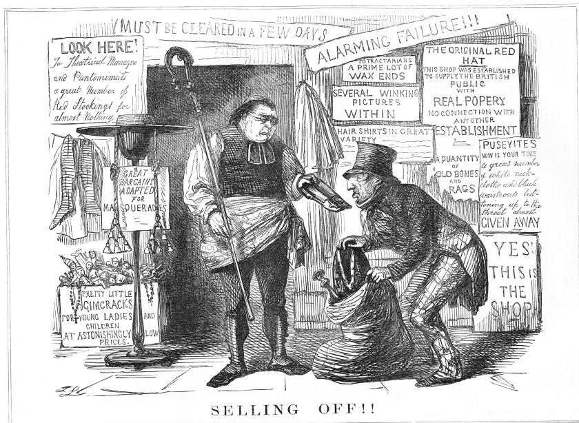
Figure 2. "Selling off!!" Punch 20 (February 22, 1851): 76.

they were so unlike those worn by Anglican Evangelicals and the Victorian middle classes. For many Victorians, the ornate costume worn by priests was associated with Gothic mystery and villainy. This fuelled suspicions that there was a Catholic conspiracy afoot aimed at confining heiresses in nunneries in order to commandeer their fortunes. For example, Charles Newdegate, an Evangelical squire and MP for North Warwickshire, convinced himself that convents were organisations designed to oppress vulnerable women and launched a prolonged campaign to have them either inspected or shut down. 23