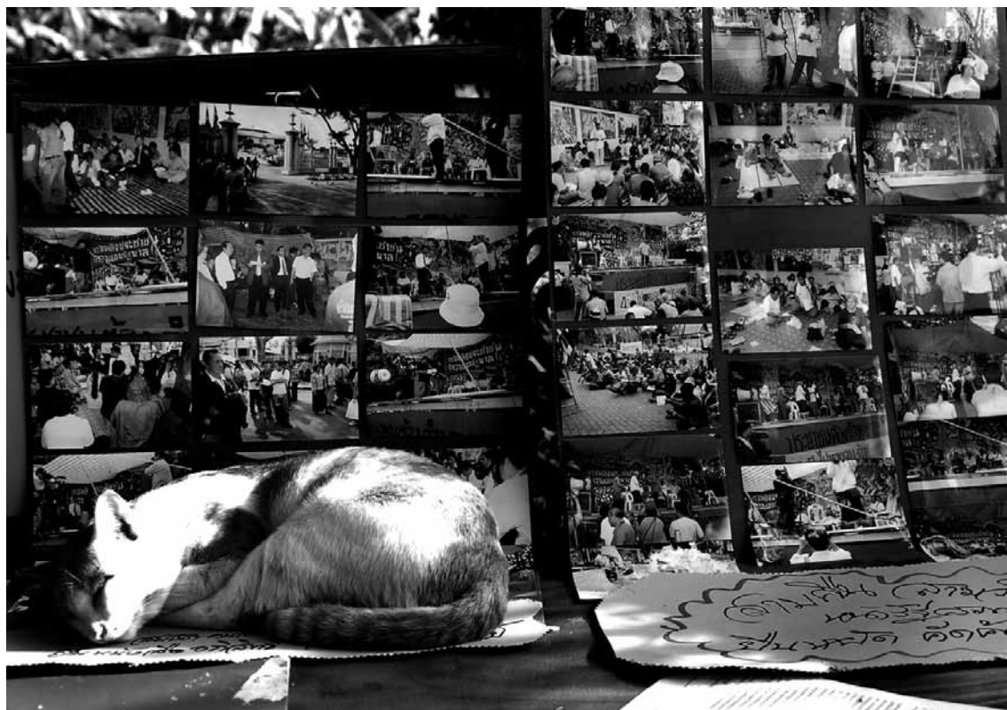
The Nam Song Conservation Club kept very good records of its campaign, including photos and notes from meetings.

And while for the moment Nam Song residents are protected from developers they still fear that other power plants will try to build on this particular site. The Nam Song Conservation Club remains committed to protecting their community from development projects because they are aware they may need to build another campaign at any moment.