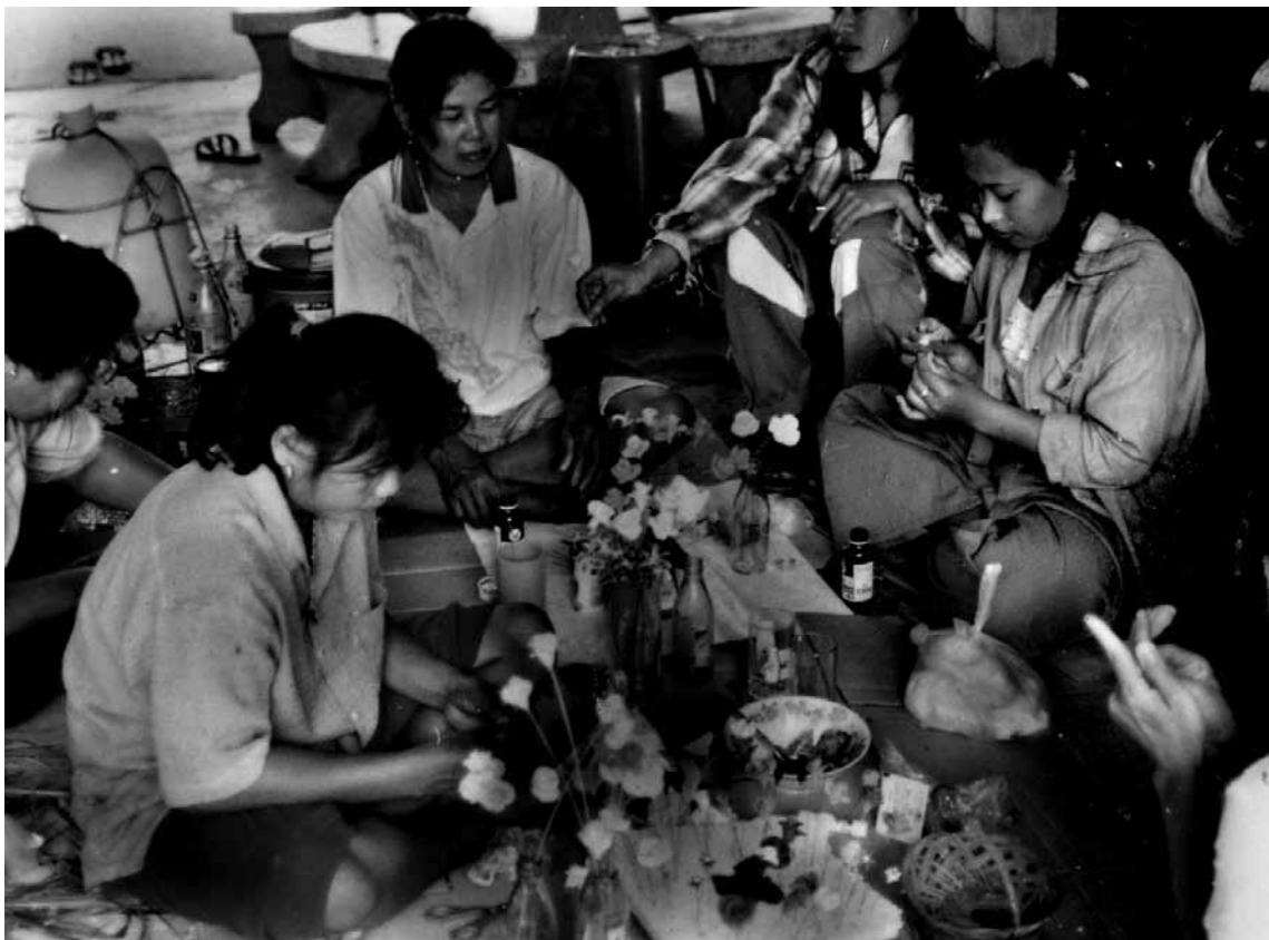
Women from Nam Song creating handicrafts for fundraising for the campaign.

The women in the village played an essential role in fundraising, organizing and maintaining trust within the community. The women made handicrafts and sweets to fundraise for the campaign. They sold t-shirts and sweets at meetings, which provided an opportunity to talk with others about the struggle and build trust. They canvassed an area of 10 km 2 and gathered 4,000 signatures for one of the rallies at the government headquarters.