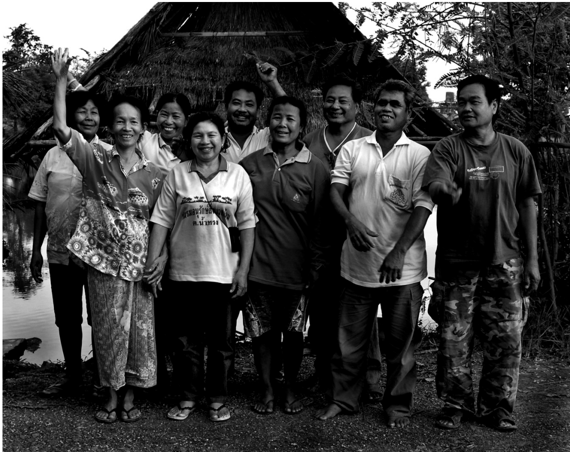
Members of the Nam Song Environmental Conservation Club