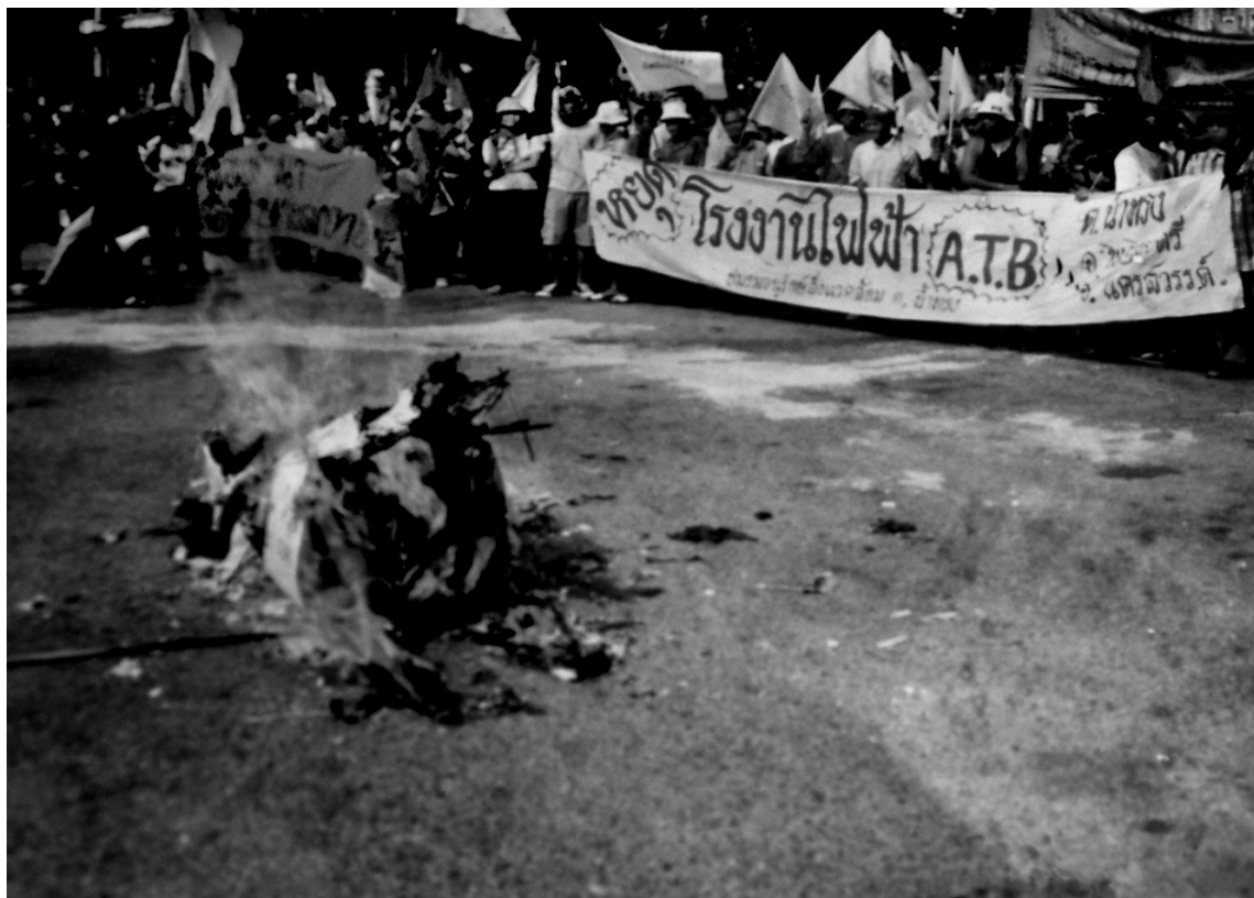
Banner reads, 'Stop the Electricity Plant A.T.B'.

This incident provoked the villagers to send a grievance letter to the local government. Initially, they were divided over whether the power station should be built, which caused strife in daily life as well as between family members. Eventually, they resolved to end their divisions. The entire community of Nam Song agreed to sign the letter stating their objections to the meeting and to the proposed station. The villagers then created the Nam Song Conservation Club to co-ordinate a full-scale campaign against the project.