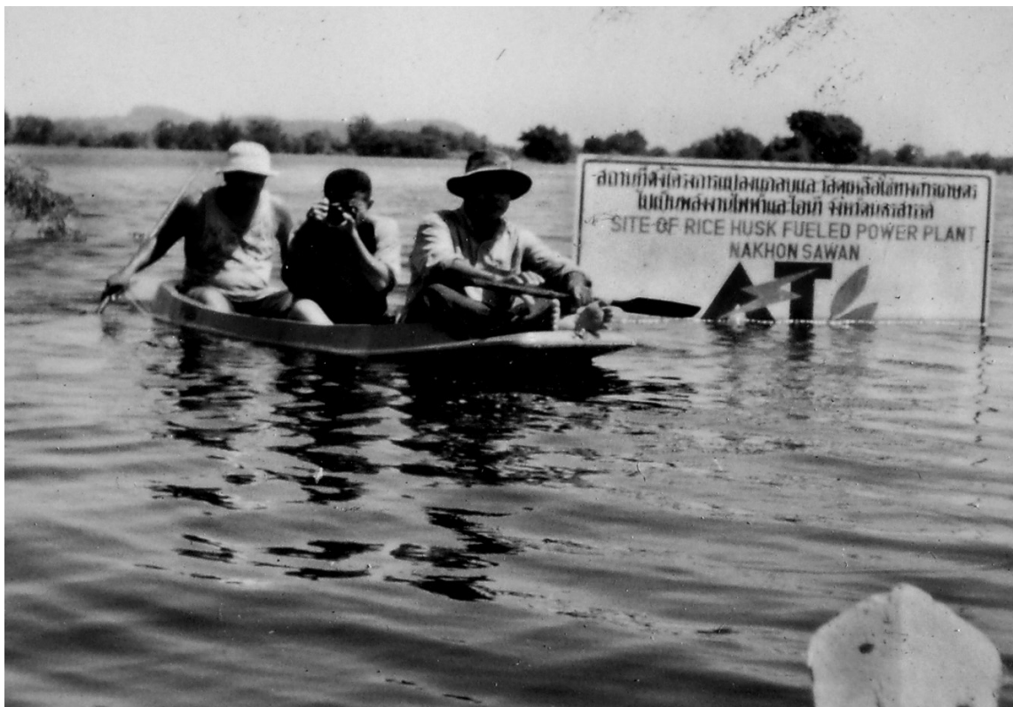
Site of proposed A.T. Biopower plant near Nam Song during the seasonal floods.

The developers used several tactics that are common in such situations in their attempts to stop the protests. Members of a community in the nearby Pichit province, who were also facing the possibility of a new biomass power station, were sent by the company to bribe the village leaders, offering them compensation to stop protesting. All of the village leaders were told by developers and local government they could be in danger if they continued the campaign. Various threats were made, large bribes were offered, and the villagers were repeatedly lied to in attempts to destroy their unity.