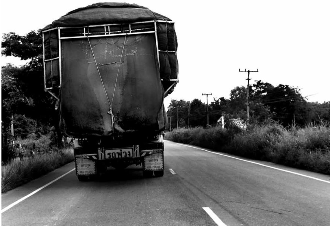
A truck piled with bags of rice husks on its way to the Pichit power station.

Local farmers in the region commented that they will have to replace this natural fertilizer with chemical fertilizers now because demand from the power plant has driven up the price of rice husks, meaning they are no longer affordable. 4 Local chicken farms and brick factories have to go further away to source rice husks, destroying a once self-sufficient system.