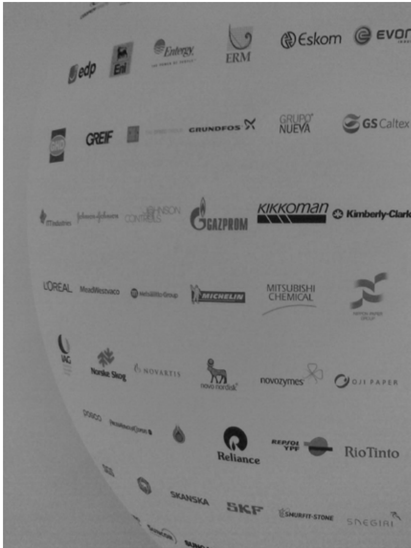
Figure 1: The world according to the World Business Council for Sustainable Development: a smooth earth populated by corporate logos. From the WBCSD display at the 2008 World Conservation Congress of the International Union for the Conservation of Nature.

WBCSD stand at the 2008 World Conservation Congress, is suggestive of its planetary reach and ambition. It depicts the brand logos of many of the world's largest multinationals, stretching across an abstract earth, smoothed of difference, diversity and inequality. This is a world good for capital. But is it also good for cultural and ecological diversity?