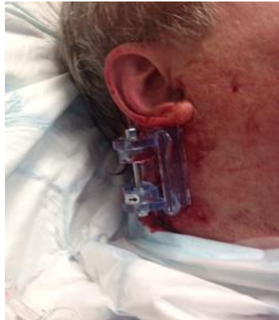
Figure 2: Case 1 iTClamp application to the neck. Following a post-operative bleed from the surgical removal of a basal cell carcinoma in the neck.

Case 2: A 54-year-old man was assaulted with a knife and sustained two stab wounds. The first stab wound was to the right side of neck and a second stab wound was to the right temporal area (Figure 3). The patient lost approximately 1.5 liters of blood on the scene (Figure 4). A single iTClamp was applied to each wound and the bleeding stopped immediately