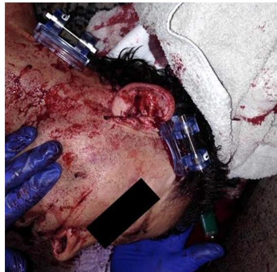
Figure 5: Case 2: iTClamp application One iTClamp was applied to each of the stab wounds (one to the temporal region and one to the neck) to stop the bleeding. First responders reported no issues with airway management.

The prevalence of CMF injuries is significant in both the civilian and military setting. 1,3 However, despite the prevalence rate and negative sequel associated with uncontrolled CMF hemorrhage there is still a tendency to ignore these injuries in favor of the completion of the primary and secondary surveys. 4 This tendency highlights the notion that care providers continue to underestimate the amount of blood that can be lost from the scalp. 4 During mass casualty, where a diminution in the quality of trauma care is experienced, 11 discounting