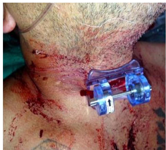
Figure 6: Case 3: iTClamp neck application following a self-inflicted injury Post iTClamp application to the neck following a series of self-inflicted injuries. No issues of airway management were reported.

CMF hemorrhage could be especially prominent. The current standard of applying direct pressure may not be manageable during mass casualty or even when a single patient has multiple injuries that require attention. 7 Other potential techniques such as utilizing Raney clips, 4 or lassoing the artery in order to ligate the vessel, 7 have been previously suggested as an alternative to direct pressure. The value in these alternatives is that they allow the care providers to be hands free to deal with other patients, other issues or even transport to