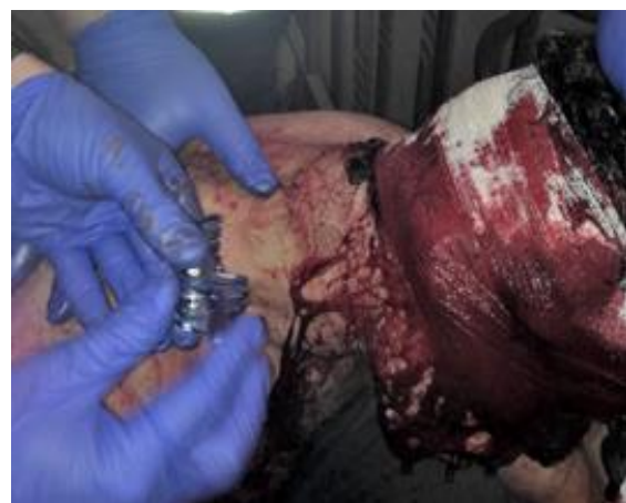
Figure 3: Case 2: Stab wound to the temporal area This patient was stabbed twice once in the temporal area and once in the neck following an altercation. This image is pre iTClamp application but post gauze application. This image demonstrates the amount of blood loss and wound severity.