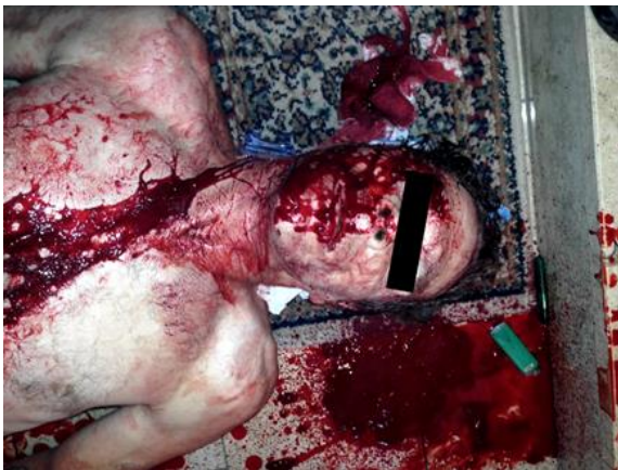
Figure 4: Case 2: Scene shot post iTClamp application This is an image of the scene after iTClamp application to the patients temporal region and neck. The bleeding was now under control. It was approximated that the patient lost 1.5 liters of blood on scene from the two stab wounds he sustained.