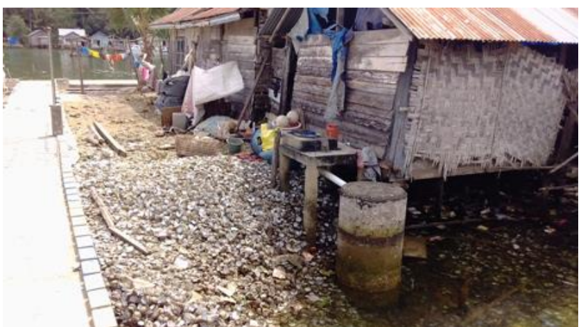
Figure 1. The waste of kalandue's shell is seen to be mounting and has not been utilized optimally

Ornaments and accessories made as a business opportunity have a market share. It is based that many people are enthusiastic if buying decoration items and accessories. Ornaments and accessories can be made more unique and look beautiful when created creatively and innovatively (Sari et al., 2013). In connection with the provisions of CCRF (Code of Conduct for Responsible Fisheries), the business of fishery products must be processed more optimally and environmentally friendly. The amount of solid waste shell shells produced requires serious efforts to be addressed. Calcium content in shellfish can be used in cookies. Shellfish flour shell flour with 2N HCl produces the highest levels of calcium. Shellfish shell flour used in cookies products adds nutrient content (Agustini et al., 2011). Thus it can be concluded that the shell waste can be utilized as a creative and innovative product thus increasing the income.