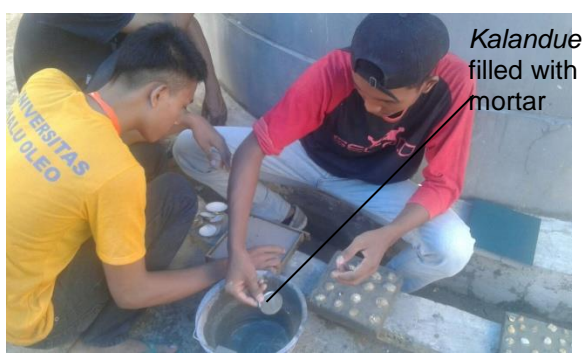
Figure 3. Kalandue shell filled with mortar

Kalandue shell was washed with water until clean and dried. Kalanduu's shell is smoothed with scrap paper. Tiles are inserted into the frame. Frame made of wood plywood. The frame is made to a size higher than 5 mm tiles.