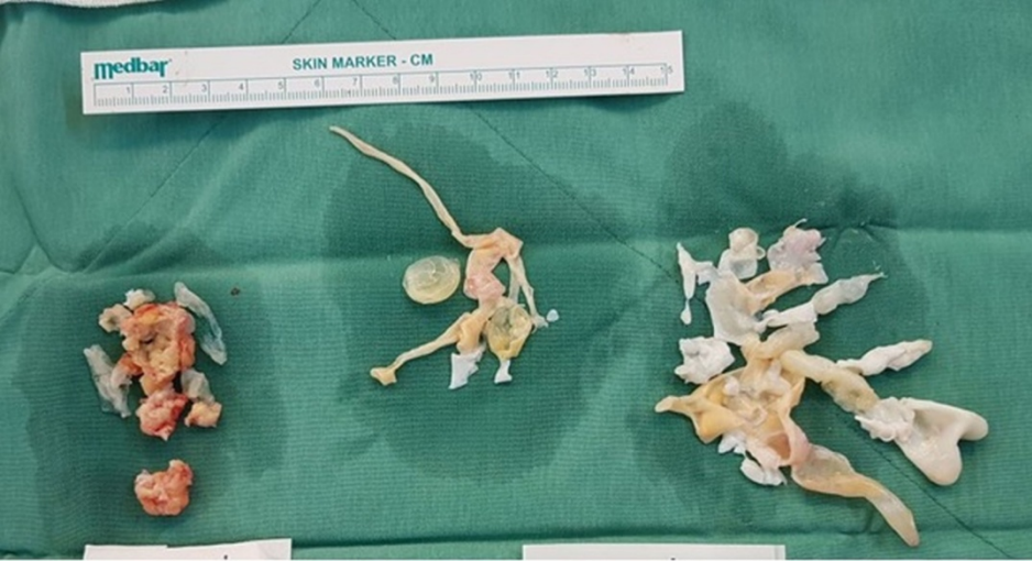
Figure 2. Intra-atrial, intra-inferior vena cava, and pulmonary artery hydatic cysts

hemoptysis 3 days after the surgery. The pulmonary cysts, intra-cardiac cysts, and inferior vena cava cysts were confirmed by pathology examination as hydatid cysts (Figure 2).