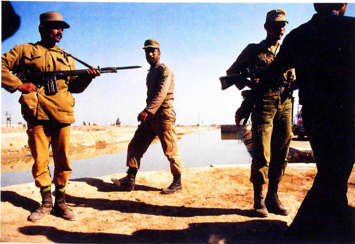
Figure 1. Photo illustrating a textbook page on resources and sustainable development (Haberlag et al., 2011: 226).

Figure 1 is an example of securitisation, that is, a referent object (water) is portrayed as valuable and threatened, hence making extraordinary measures (such as military protection) necessary. German school textbooks frequently securitise water via a three-staged argumentative chain. First, water is conceived as highly important. It is a "lifeline" (Claaßen et al., 2002: 177) and "necessary for survival" (Englert et al., 2009: 182). Second, water is considered to be naturally scarce in some regions and this scarcity is predicted to intensify in the future. The vast majority of diagrams and tables (65%) and graphics (67%) in our sample show geographical, physical and demographical information, most of which indicate increasing demand, decreasing availability, and hence a reduction of water availability per capita (Table 2). This is accompanied by pieces of text stating, for example, that "80 percent of all states suffer from acute water stress [...] An increasing proportion of humanity has no access to clean water" (Claaßen et al., 2002: 171).