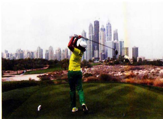
M6: Golfplatz in Dubai