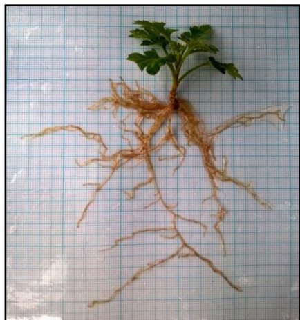
Figure 4. Dichotomic radicular architecture of Chrysanthemum cuttings (Scale – area of one minimal square is 1 mm 2 )

Knowing the architecture of the root system improve the correct application of chrysanthemum culture technologies in terms of properly positioning the crop on the appropriate fertility plots, ensuring soil loosening according to plant requirements, application of fertilizers, and mechanical maintenance of crops in order to does not destroy the root system. The investigation reveal the development of a “dichotomic” radicular system in the chrysanthemum cuttings – Figure 4, in which branching occurs on each axis, resulting in equivalent axes (low hierarchy). The radicular architecture model shows the efficiency of exploitation of the resources present in the substrate, the link between the developed radicular model and the substrate characteristics in terms of nutrient availability [FITTER & al. 1991]. While the herringbone model is associated with plants growing in poor nutrient soils, the dichotomic pattern observed at chrysanthemum cuttings indicate a nutrient rich substrate.