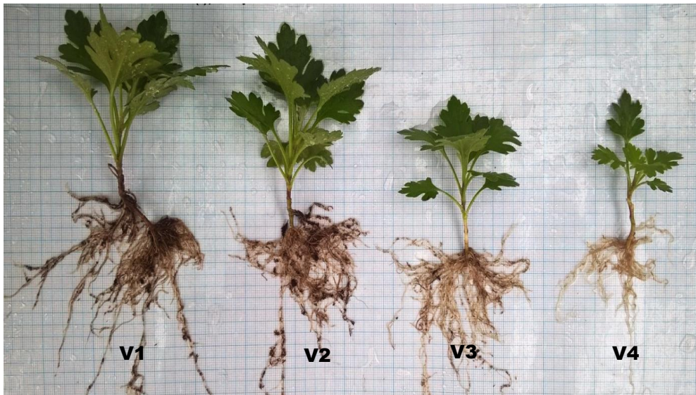
Figure 2. Influence of rooting substrate type on architecture and total root length of Chrysanthemum indicum cv. Carmina cuttings (V1–peat 100%, V2–peat+perlite (v/v), V3–peat+perlite+sand (v/v/v) and V4–perlite 100%; Scale - area of one minimal square is 1 mm 2 )

Regarding the influence of rooting substrate type on total root length, one can notice differences both visually (Figure 2) and mathematics, based on data and calculation using the Newman formula.