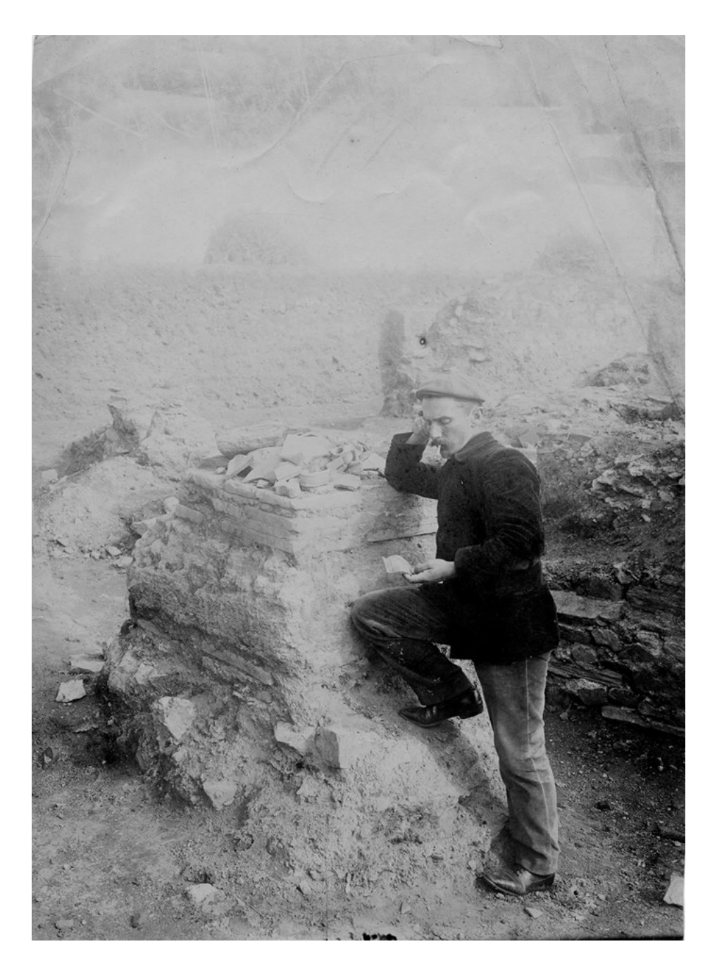
Fig. 1 – Miloje Vasić at Viminacium in 1907.