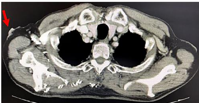
Fig. 2. Computed tomography imaging. Irregular thickening of the right axillary skin was noted.