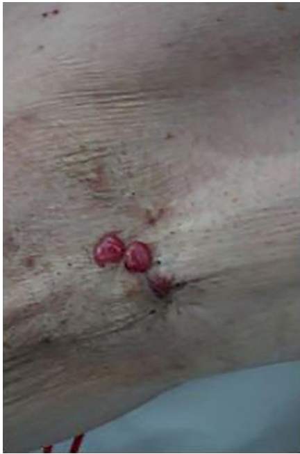
Fig. 1. The right axillary skin appearance. Small reddish nodules were noted at the same site as the synchronous cutaneous metastasis.