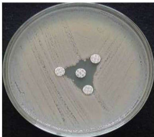
Figure (1). Double Disk Synergy Test (DDST) Center: Clavulanic acid disk; around: 3 rd generation cephalosporins (cefotaxime, ceftazidime and ceftriaxone).

All 175 isolates showed positive results by the DDST (Fig.1) which indicates that all these isolates were putative ESBLs producers. These results were 100% the same as that obtained by Phoenix System (Lee et al. , 2008). The disk synergy test is regarded as the most effective for detecting ESBL-producing strains (Dechen et al. , 2009).