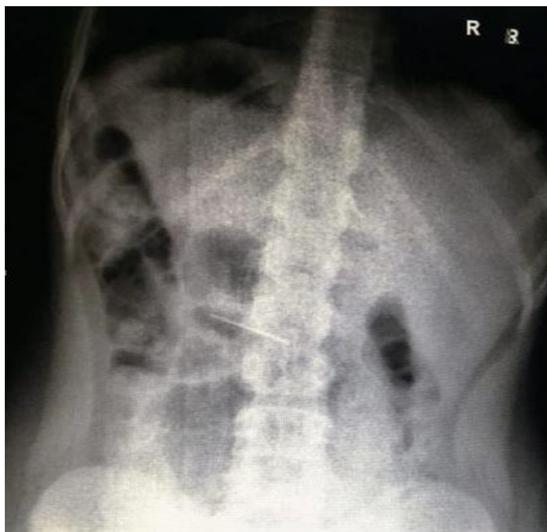
Fig.2: Abdominal X-ray showing the needle had passed the pylorus.