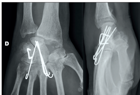
Figure 1. Case 1 using 4 Kirschner wires and 1 staple.