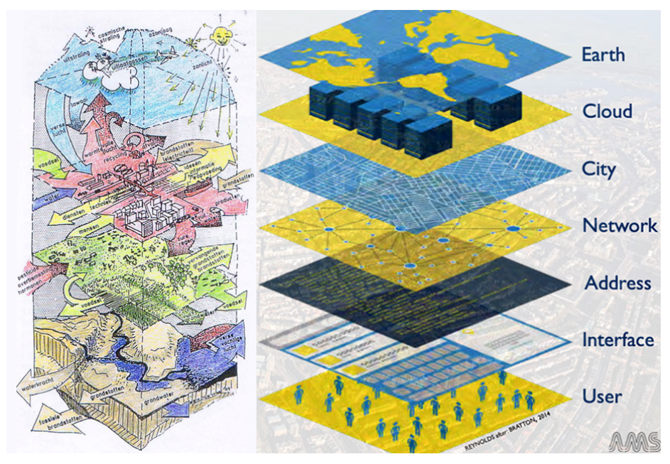
Figure 2. Kristinsson's (2012) 3D-model of the city as an ecosystem (left); van Timmeren and Henriquez' (2015) "the Stack" layers including recent digital additions (right).

Where most of Kristinsson's (2012) work focuses on the building itself, trying to optimize the indoor climate and direct environment of the building using technological innovations that make use of the different available