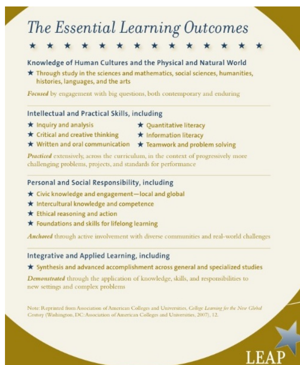
Figure 1. LEAP (2005) Essential Learning Outcomes.

The LEAP National Leadership Council (2007) refers to a "Framework for Excellence," which encompasses the process of integrating ELOs across disciplines through an intentional focus on the part of teachers and students. As part of the LEAP initiative, AAC&U also promotes the importance of "High Impact Practices" to support the students' acquisition of essential learning outcomes. The council emphasizes the importance of offering students opportunities to apply interdisciplinary knowledge and to acquire a perspective for learning that involves creating knowledge through real-world problem-solving activities.