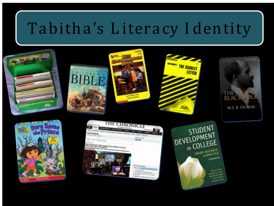
Figure 2. Tabitha's visual representation.

writers that wrote about things that I had been feeling. I learned how to articulate my thoughts through their texts.”