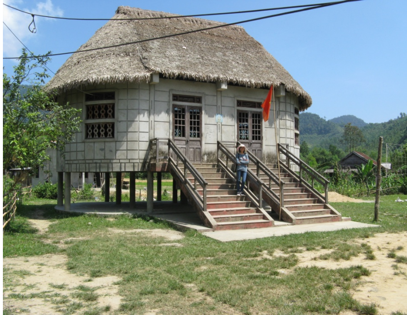
Figure 1: Communal House in Tavac.

In terms of forest ownership, Co Tu identified two regimes of land and forest tenure: common property and private property. Common property is understood at three levels: community, clan and family. Co Tu people classified the forests into four categories (Arhem 2009; Tuan 2006):