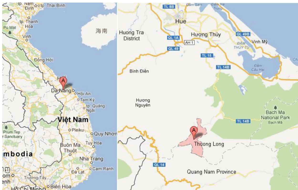
Figure 2: Location of Thuong Long Commune.

trading products (Van et al. 2004). The average GDP per capita in 2010 was 8,323,000 VND (USD $ 462) a year, against the national average income of USD $ 1,083 per capita/year (Statistical Yearbook 2010).