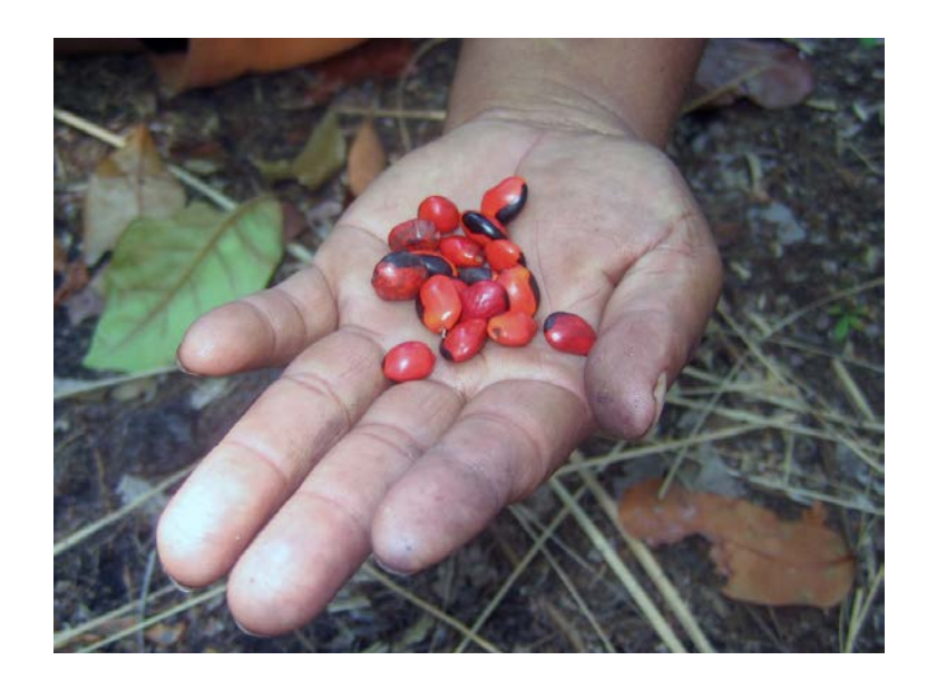
Figure 3. Photograph of seeds collected.

Verswijver (1992b), when discussing different toponyms among the Kayapó, briefly notes a similar tendency toward marking the landscape with historical events. Likewise, Fernando Santos-Granero (1998:130–131) indicates that the walks he made with the Yanesha often combined personal, historical, and mythical elements, thus inscribing history within the landscape. While Santos-Granero (1998) labels these elements "topograms" to reflect their applicability to protowriting systems, others also have documented the way in which moving through the landscape enlivens historical moments (Hirsch and O'Hanlon 1995; Schama 1995). For example, Mark Nuttall, when working with Inuit groups, prescribes the term "memoryscapes" to reflect the way in which "persons, community, and landscape and the contemporary, historical, and mythical activities, events and stories that invest the environment with meaning" are linked (1998:125). And Aporta (2004:11), also working in the Arctic, suggests that routes are a part of "courses that remain and evolve in the memoryscapes of the people" and that " trails refers to the physical manifestation of routes."