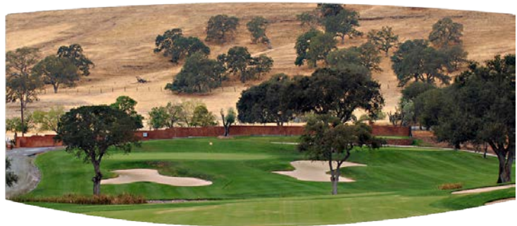
Figure 2: Images showing contrast of dry grass of the area with golfing greens. Top: Google Map aerial view (accessed 5/3/2012). Bottom: photo from <a href="http://www.trinitasgolf.com/">http://www.trinitasgolf.com/</a> (accessed 4/27/2012).