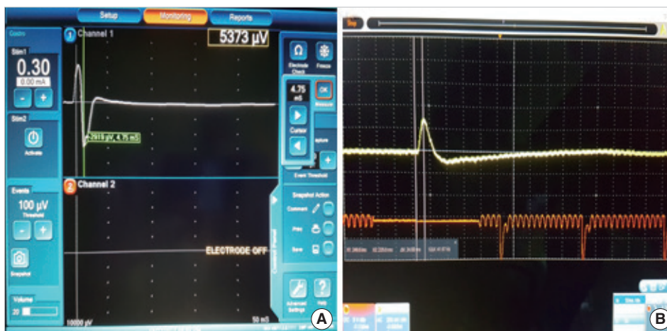
Fig. 2. Electromyography (EMG) and piezo-electric surface pressure sensor recordings, showing the amplitude and latency of the EMG and surface pressure sensor for 0.3 mA stimulation using the Nerve Integrity Monitor (NIM) 3.0 system in one rabbit. (A) EMG signal. (B) The modified piezo-electric surface pressure sensor signal.