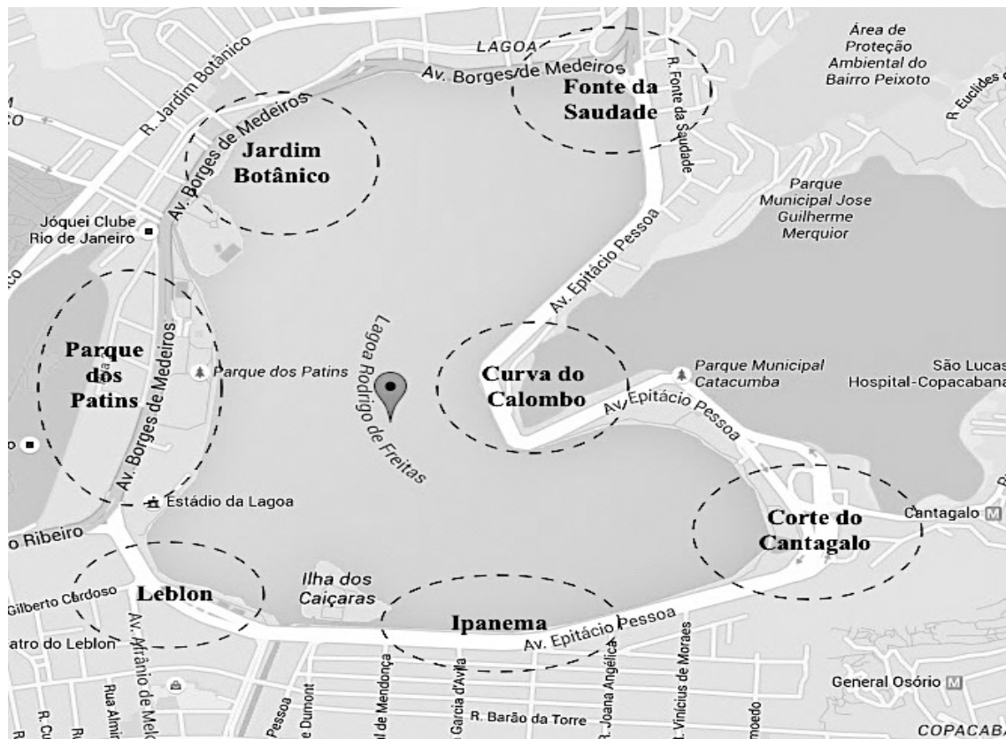
Figure 2. Fragmentation of Lagoa Rodrigo de Freitas into micro-regions

It is worth pointing out that 22 passersby (among residents, tourists, and habitual sport players in the region) were randomly interviewed and 45 formal and informal enterprises or associations, with the purpose of answering the referred questions: (A) What were the main impacts (should they be positive and/or negative) noticed by the stakeholders? (B) What were the practices of stakeholder management adopted? And did they consider the heterogeneity of publics that constitute the different territories? And (C) did the mega-event leave a legacy for the local community of Lagoa Rodrigo de Freitas?