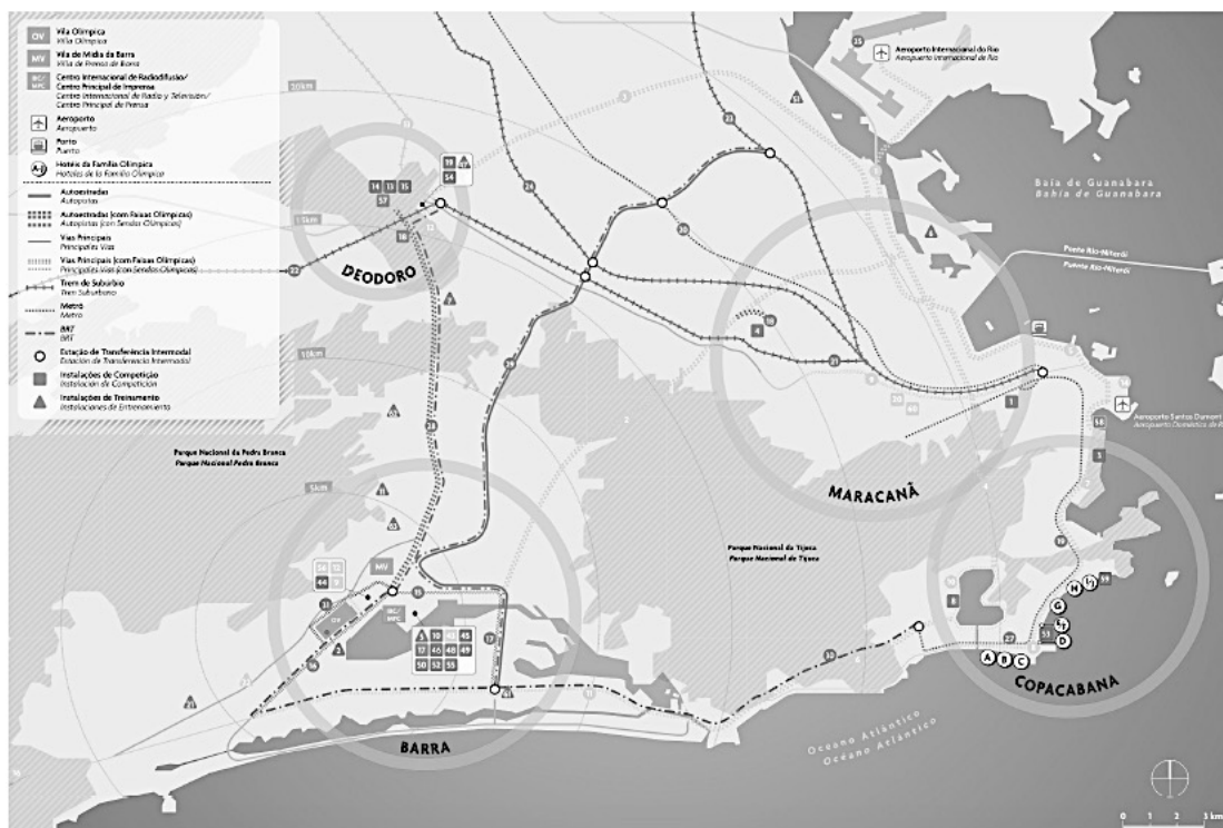
Figure 1. Map of venues of the Rio 2016 Games

It is in this heterogeneous and multicultural space that the Rio 2016 Olympic Games (the object of this study) were held in different geographic locations of the host city, from August 5 th to 21 st , and the Paralympics were held from September 7 th to 21 st . The Olympics, according to the Rio 2016 official website (2016), involved 42 sports, 306 events, 37 arenas, and competitors from 205 countries. Despite all the structure of this event spread throughout the micro-region of Rio de Janeiro, some neighborhoods stood out, concentrating the competitions, according to Figure 01: Deodoro, Copacabana, Barra da Tijuca, Maracanã, and Lagoa Rodrigo de Freitas.