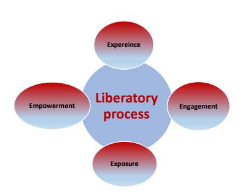
Figure 4: "4Es" Practice Model: Steps towards Liberation Source: Adapted from Winderdyk & Dhungel (2018)