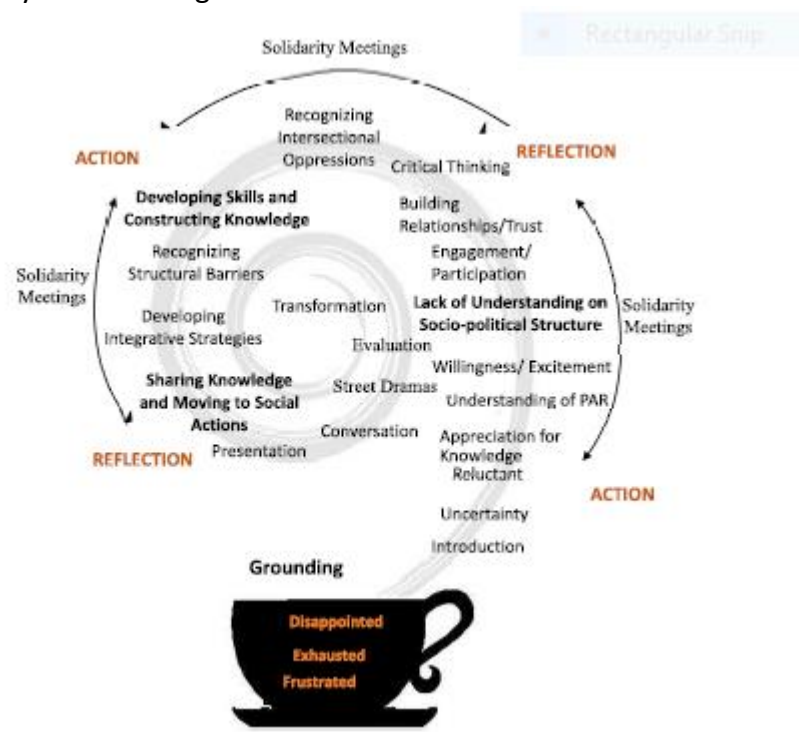
Figure 1: Action-Reflection-Action: The Figure Demonstrates the Progress and the Summary of the Integrated Phases of our Liberatory Journey

work collaboratively. While reflecting on our journey, we recognised that we went through different, interconnected yet overlapping phases: (1) grounding context; (2) understanding the critically socio-political (3)environment; developing skills knowledge; (4) constructing and sharing knowledge and moving into social, political and cultural action as demonstrated below in Figure