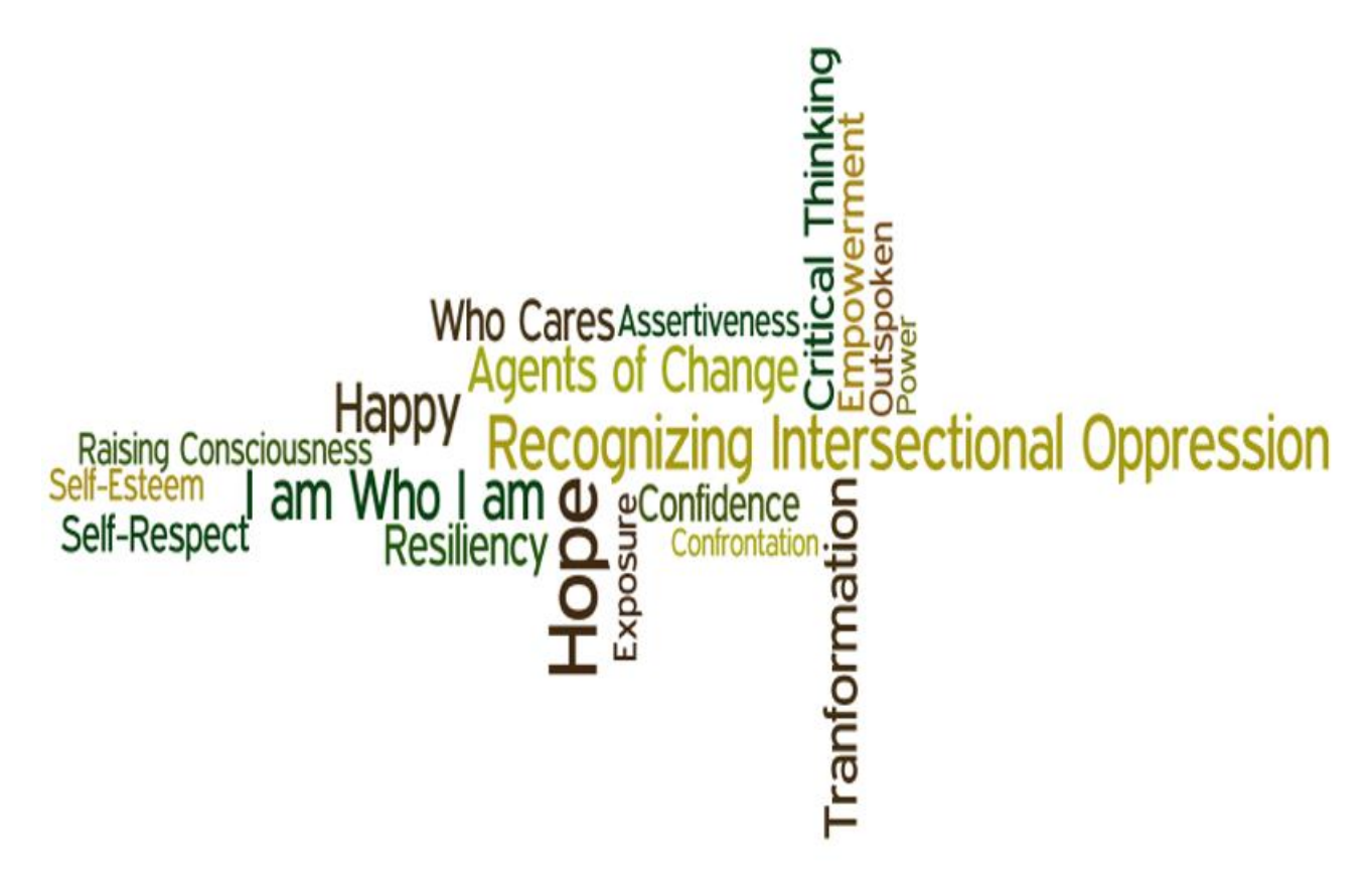
Figure 3 Liberation: This Figure Depicts our Outlooks and State of Mind in a Transition of Oppression to Liberation