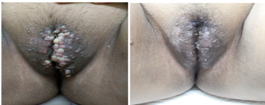
Figure 1. (A) Clinical Manifestation before treatment. Multiple clusters of colourless until yellow-ish in genitalia region; (B) After 5 times of cryotherapy. The lesions nearly got full remission.

Acquired vulva lymphangioma could be attributed to many conditions. These include congenital and acquired lymphedema associated with infections such as filariasis, sexually transmitted disease, tuberculosis, erysipelas, and lymphogranuloma venereum, Chron's disease, congenital dysplastic angiopathy, surgical or radiotherapeutic procedures, trauma, keloids, scleroderma, and lymphatic obstruction associated with neoplasia. 6,7 In our patient, tubercular lymphadenitis coupled with scarring led to the obstruction of the vulval lymphatics resulting in lymphangioma.