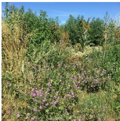
Figure 3. Natural vegetation on reconstituted soil.

a new ecosystem. In the area actually, they are planted more than 5000 species of native trees and shrubs to support revegetation and animal repopulation. Planting, already tried - before reconstitution - without any success, has been possible thanks to reconstituted soils properties, such as soil structure, high organic matter, increase root restricting layer, high fertility. These conditions wouldn't have been obtained only with soil tillage and fertilizations as many of the most important requirement to restore this area are unchangeable before reconstitution. The spontaneous recolonization occurred in the reconstituted soils (Figure 3) before planting gives evidence of fertility of reconstituted soils in comparison with human transported materials (Figure 4).