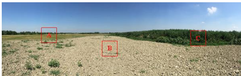
Figure 2. Closed landfill: [A] human transported material; [B] reconstituted soil; [C] natural vegetation on reconstituted soil.

These results demonstrate how the reconstitution technology can convert the environmental and agronomic conditions from soil having severe limitation - due to poor vegetation and anthropogenic materials -, to a condition of moderate limitations. This change allowed to restore an abandoned area, lead to productivity and to environmental and forest prosperity. The soil improvements allow area to be