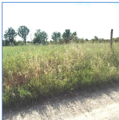
Figure 4. Natural vegetation on human transported material.