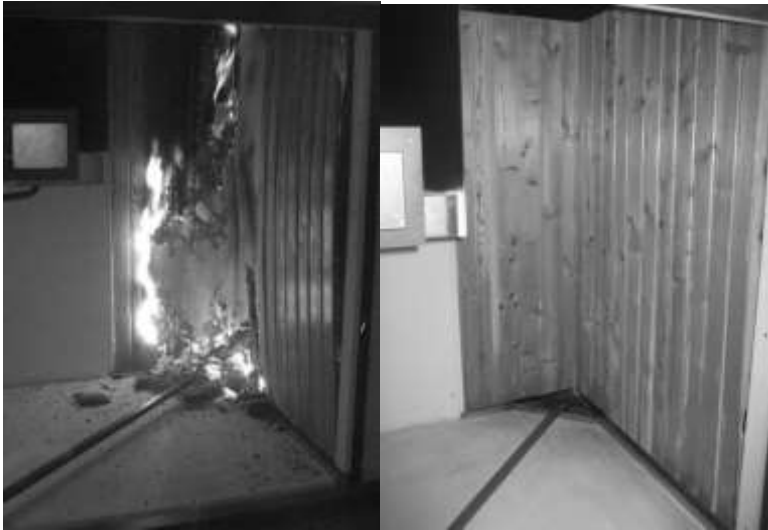
Fig. 1. Test samples. Fig. 2. Samples after the test.

heat released while burning THR (MDzh), the length of the flame distribution LFS (m), smoke emission intensity SMOGRA ( \text{m}^2/\text{s}^2 ), and the total amount of the emitted smoke TSR ( \text{m}^2 ) (Fig. 2).