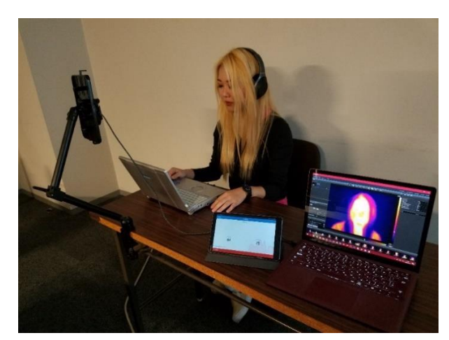
Fig. 3. Evaluation experiment recording a thermal video of face over watching a video clip