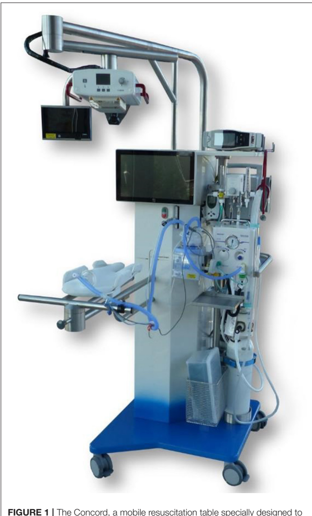
FIGURE 1 | The Concord, a mobile resuscitation table specially designed to provide full standard care in stabilization of preterm infants at birth while the cord remains intact.