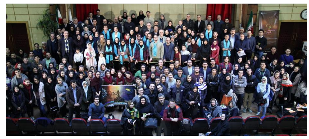
Figure 3. The group photo of 3rd USERN Anniversary, Jan 1st 2019, Avicenna Hall, Tehran University of Medical Sciences