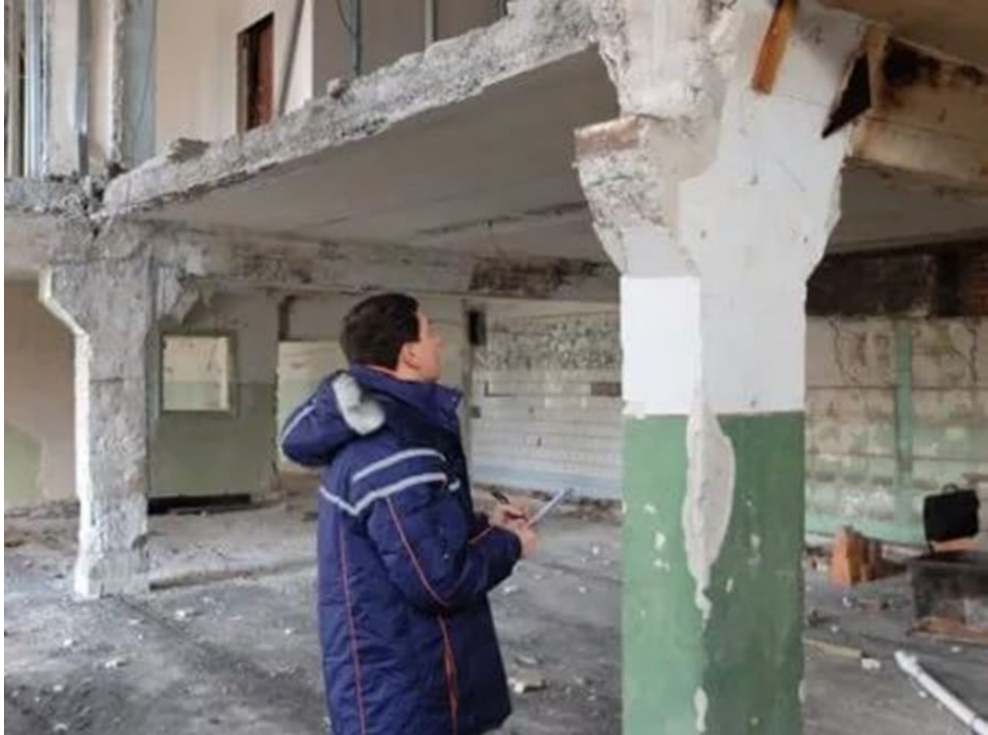
Fig. 2. An example of ignoring the restorative repairs at the results of the technical monitoring: differential settlement of foundations was the cause of the deflections of beams and slabs

with the restoration of the operational properties of structures, lead to social and environmental damage. Therefore, it is important to properly and timely assess the condition of structures and equipment of buildings, to predict the possible development of defects and to develop measures to stabilize or eliminate them. It is necessary to have an understanding of the mechanism of destruction and wear of structural elements in the process of operation, the mechanism of the influence of environmental factors operating on the construction of the structure [2-6].