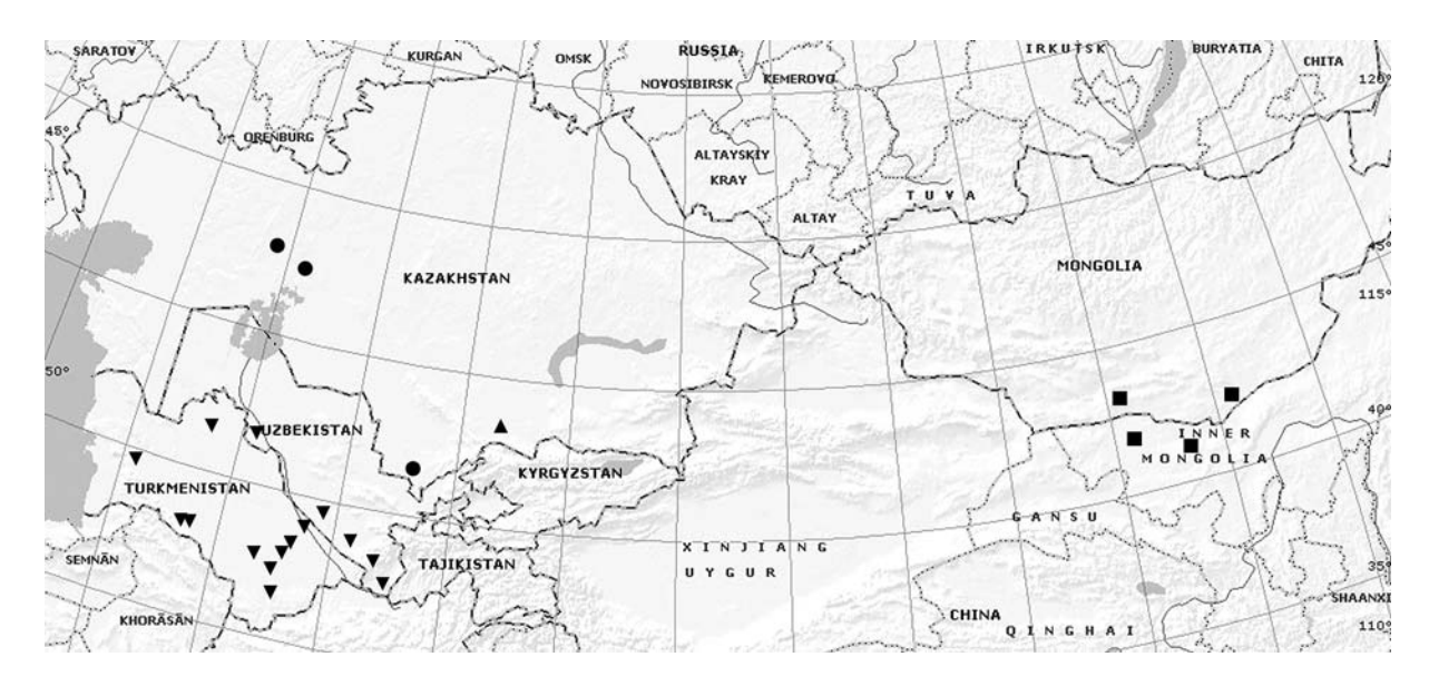
Fig. 25. Map of distribution of Aphilenia lopatini sp. n. (\bullet) , A. mujunkumica sp. n. (\blacktriangle) , A. unicolor Reitter, 1889 (\blacktriangledown) and A. gobica Lopatin, 1970 (\blacksquare) . Рис. 25. Карта распространения Aphilenia lopatini sp. n. (\bullet) , A. mujunkumica sp. n. (\blacktriangle) , A. unicolor Reitter, 1889 (\blacktriangledown) и A. gobica Lopatin, 1970 (\blacksquare) .

Province, Chardara [Shardara]. approx. 41°15′N / 67°55′E, 30.05.1936, 4\mathring{\circlearrowleft} , leg. D. Romashov (ZMMU). See "Remark".