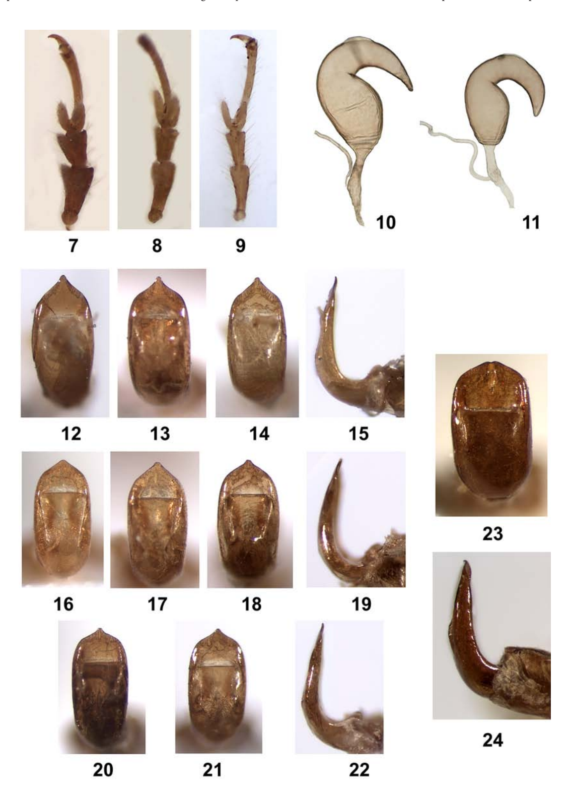
Fig. 7–24. The genus Aphilenia Weise in Reitter, 1889, details of structure.

7, 12–15 – A. unicolor Reitter, 1889 (12 – specimen from Uzbekistan, Sairob, 13 – specimen from Uzbekistan, Djar-Kurgan, 14, 15 – specimen from Turkmenistan); 8, 11, 20–22 – A. mujunkumica sp. n. ; 9, 10, 16–19 – A. lopatini sp. n. (16 – specimen from Chardara, 17 – paratype from Chelkar, 18, 19 – paratype from Kara-Chokat); 23, 24 – A. gobica Lopatin, 1970; 7–9 – fore tarsus; 10, 11 – spermatheca; 12–14, 16–18, 20, 21, 23 – aedeagus, view from above; 15, 19, 22, 24 – aedeagus, lateral view.