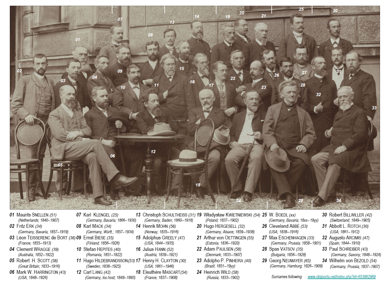
Figure 1. Participants at the International Conference of Directors of Meteorological Services, in Munich, Bavaria, Germany, 26 August–2 September 1891, 28 years prior to the formation of the Section of Meteorology. Numbering is in six columns, from left to right, with the following information for each person: number, first name, surname (age at conference, representative for country or state, and lifespan). The surnames follow the handwritten note attached to the copy kept at Deutsches Museum, Digitales Porträtarchiv, Munich, Germany (cf. website http://www.digiporta.net; last access: 25 January 2019).

pean nations plus the USA and Russia) focused their attention on the need to improve and expand observations for weather forecasting. Their efforts eventually led to the first International Meteorological Conference in Vienna in 1873 and the formation of the International Meteorological Organization (IMO) in 1879 (and, much later, inspired the formation of the World Meteorological Organization (WMO) in 1950). The IMO was led by an International Meteorological Committee composed of the directors of the meteorological services of the member nations.