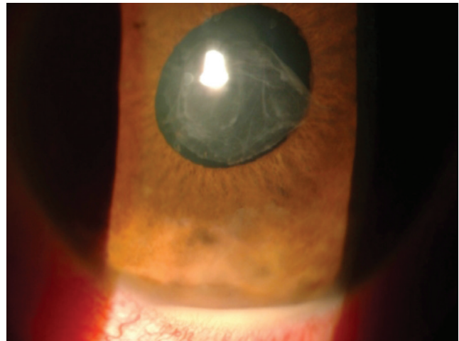
Figure 3. Anterior segment photograph of a patient with HLA-B27-associated uveitis showing hypopyon

The relationship between HLA-B27 positivity and inflammatory diseases such as uveitis, AS, reactive arthritis, ulcerative colitis, and psoriasis was first identified in 1973. 8,9,10,11 There are substantial global differences in the prevalence of HLA-B27 antigen. These differences also explain observations of different global patterns of uveitis. In their publication on the demographic and clinical properties of uveitis in Turkey, Yalçındağ et al. 12 reported the prevalence of HLA-B27 antigen in the Turkish population as 6.8% and that HLA-B27-associated