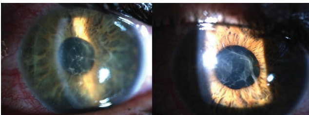
Figure 2. Anterior segment photograph of a patient with HLA-B27-associated uveitis showing fibrinous uveitis (left) and regression of the fibrinous reaction after 3 days of topical therapy (right)

( p=0.291 ) (Table 3). Prevalence rates of ocular complications are presented in Table 4. The most common complications during follow-up were complicated cataract ( n=12 , 6.7%) and ocular hypertension ( n=15 , 8.3%). Eight eyes (4.4%) underwent phacoemulsification and intraocular lens implantation, while 1 (0.56%) underwent trabeculectomy due to secondary glaucoma.