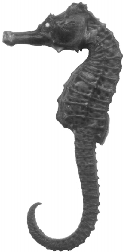
Figure 2. Hippocampus reidi (MPEG 11244) captured in the mangrove estuary of Curuçá River, Pará, North Brazil.

The fish was a female with a total body mass of 5.1 g. Diagnostic features of the specimen are: 11 trunk rings, 33 tail rings, 3 rings supporting dorsal fin (2 trunk rings and 1 tail ring). Dorsal and pectoral fin with 17 and 16 rays, respectively. In the fresh fish the body was profusely spotted with brown dots and numerous tiny white dots.