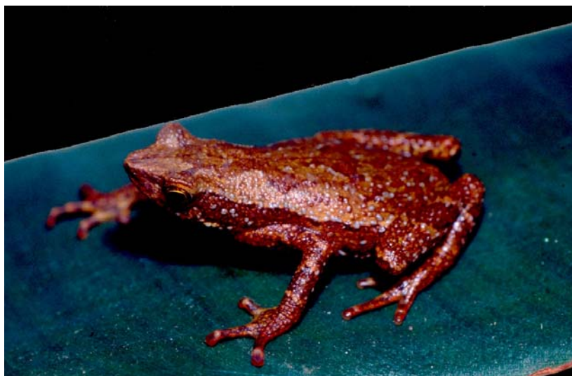
Figure 1. Dendrophryniscus berthallutzae , adult male from São Bento do Sul, state of Santa Catarina, Brazil.

Herein we report new records for D. berthallutzae (Figure 1) at Paraná and Santa Catarina states: MCP 7690, municipality of Guaratuba (25°52' S, 48°52' W), state of Paraná; MNRJ 31809, municipality of Itapoá (26°06' S, 48°36' W); MNRJ 49537, municipality of São Bento do Sul (26°19' S, 49°23' W); MZUSP 55851, municipality of Pirabeiraba (26°20' S, 48°56' W), MCP 8273, municipality of Santo Amaro da Imperatriz (27°40' S, 48°40' W), and MZUSP 35450-35458, municipality of Novo Horizonte (28°28' S, 49°33' W), state of Santa Catarina. These new records extend the distribution of this species 50 km northwards and 240 km southwards from the type locality (Figure 2).