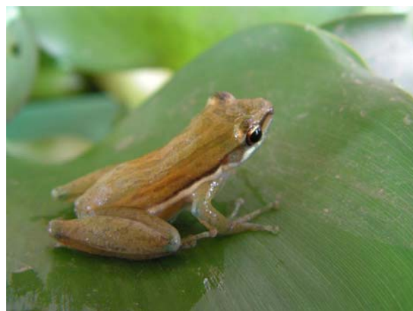
Figure 1. Scarthyla vigilans from Caño Macareo, northwestern Venezuela.

During a biodiversity survey carried out in Caño Macareo in the Orinoco Delta, state of Delta Amacuro, northeastern Venezuela (09°48'32" N, 61°40'29" W; 5m), from 16 to 25 May 2006, FRR and JCS found several specimens of Scarthyla vigilans (Figure 1). Six specimens were collected and deposited at the Museo de Historia Natural La Salle, Caracas (MHNLS 17734, 17754-8).