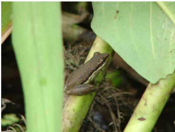
Figure 2. Scarthyla vigilans from El Clavo Dam, northern Venezuela.

The record from the Venezuelan Coastal range is based on a single individual photographed (Figure 2) by ICF during a field botanical assessment development in a wetland near El Clavo Dam, state of Miranda (10°15'16.9" N, 66°07'53.9" W; 14 m), on 2 August 2007. In this locality, S. vigilans was particularly abundant and several males were observed calling actively at around 15:30 h, in grasslands, semiaquatic, and aquatic foliage of the wetland.