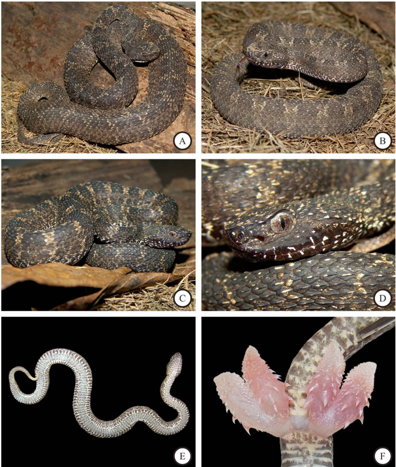
Figure 1. Specimens of Bothrops lutzi found in the present study with their main color patterns and some diagnostics characters. A-C) General view of adult females with snout-vent length of 72.0, 45.2, and 59.0 cm respectively; D) Head detail; E) Ventral color pattern of a juvenile female (SVL = 34 cm); and F) Hemipenis of an adult male SVL = 52.8 cm).