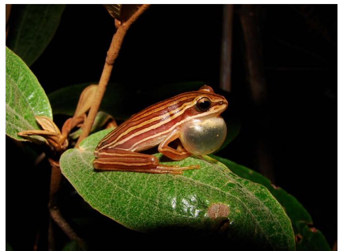
FIGURE 1. Adult male of Hypsiboas buriti (Caramaschi and Cruz 1999), Fazenda Água Limpa, Brasília.

At Fazenda Água Limpa, Brasília, the individuals were found close a permanent pond with 15 m 2 total area, and 2 m of maximum depth, formed by the damming of a small creek. The plant cover of this pond is mainly composed by invasive or opportunistic plants, as Pteridium sp., Tibouchina sp., Trembleya sp., and other Melastomatacea plants. The individuals call from several kinds of perches,