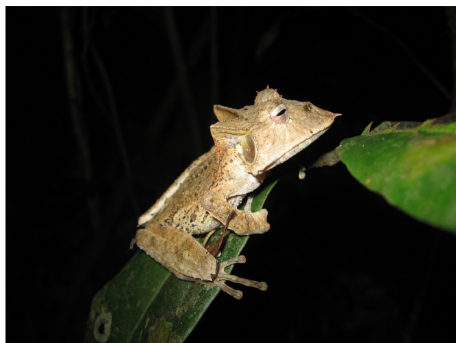
FIGURE 1. Specimen of Hemiphractus helioi found on the vegetation (1 m above ground) at night on 13 November 2008 in Mõa River forest, municipality of Cruzeiro do Sul, Acre, Brazil.

These new records from the lowland forest of Mõa River in Cruzeiro do Sul extended the range of this species about 100 km to the east (Figure 3) from the nearest collection site known in Parque Nacional da Serra do Divisor (Souza 2009).