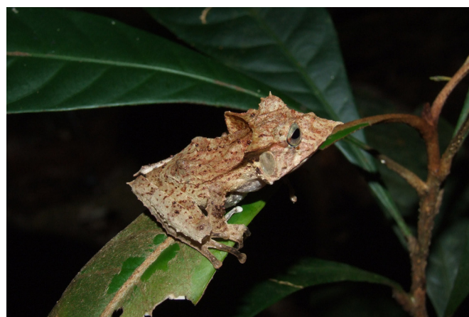
FIGURE 2. Specimen of Hemiphractus helioi found on the vegetation (40 cm above ground) at night on 15 December 2008 in Mõa River forest, municipality of Cruzeiro do Sul, Acre, Brazil.