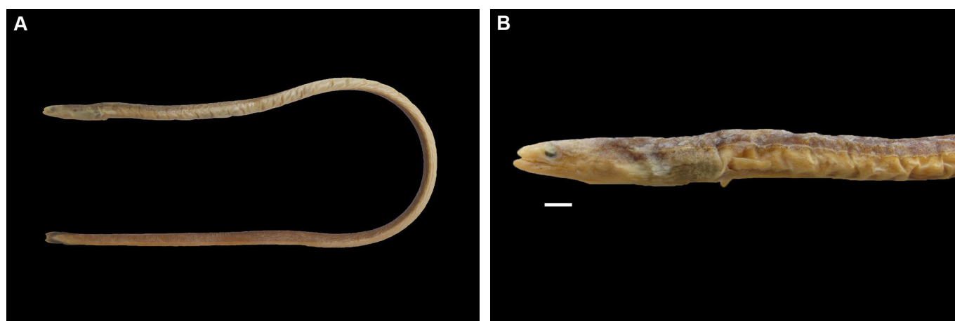
Figure 1. Moringua edwardsi (CIDRO 67, 301.0 mm TL) collected in Atol das Rocas, northeastern Brazil. The entire animal (A) and a close-up of the head (B). Scale: 3.0 mm.

Description: Pectoral fin rays 10; lateral-line pores to anus 74; total vertebrae 110; predorsal vertebrae 84; preanal vertebrae 84. Measurements in percent of TL: head length (HL) 7.3, preanal length 68.3, and body depth 1.7. Measurements in percent of HL: eye diameter 4.0, snout length 15.0, upper jaw length 20.9, and pectoral fin length 19.5. Lower jaw projects beyond upper jaw; dorsal fin is inserted behind level of anus; lateral line complete. Mature specimen. Coloration: dark brown on dorsal region and caudal fin, pale white ventrally; dorsal, anal and pectoral fins yellowish (Figure 1).